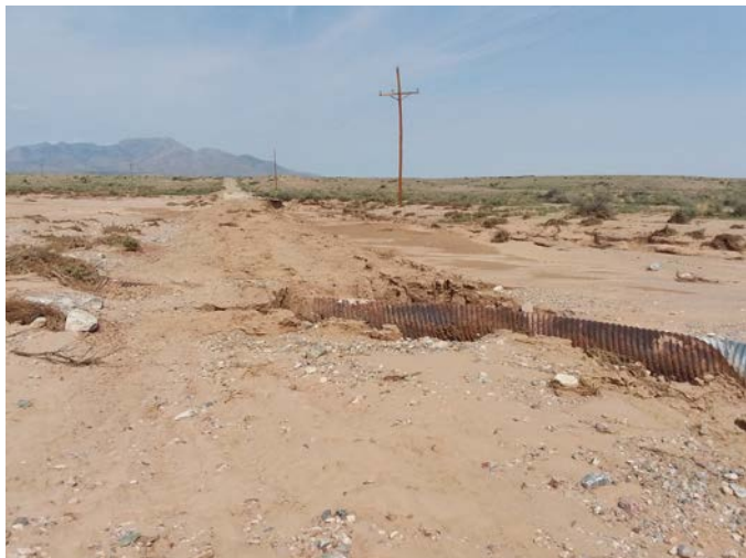
ATT Road Damage