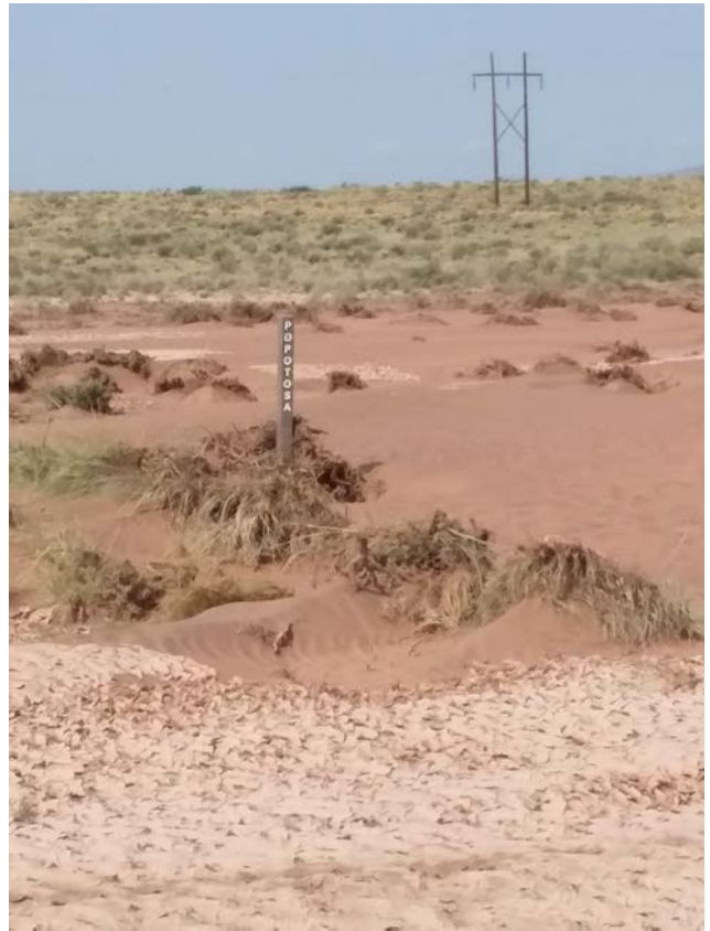
Popatosa Road Sign