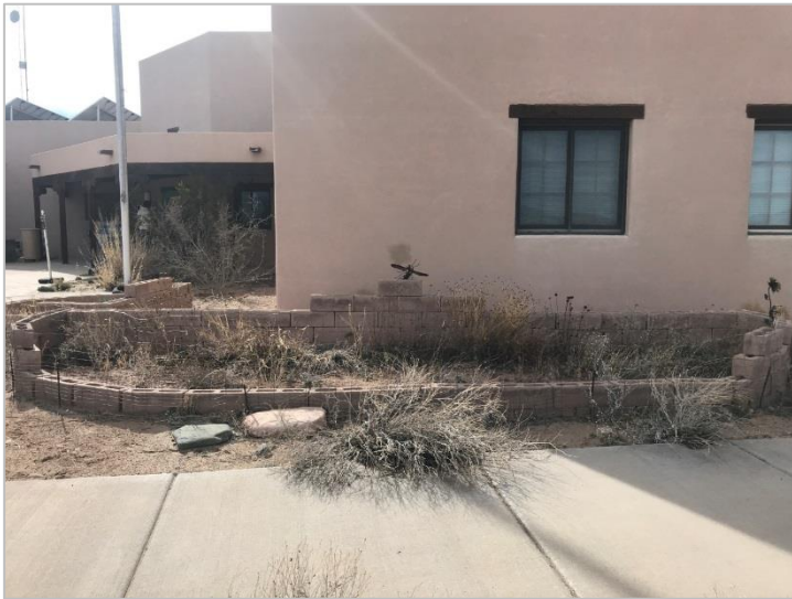
Pollinator Garden prior to new fence construction

The fence was financed by private contributions from Amigos members. The Board would like to thank all who contributed their time and funds.