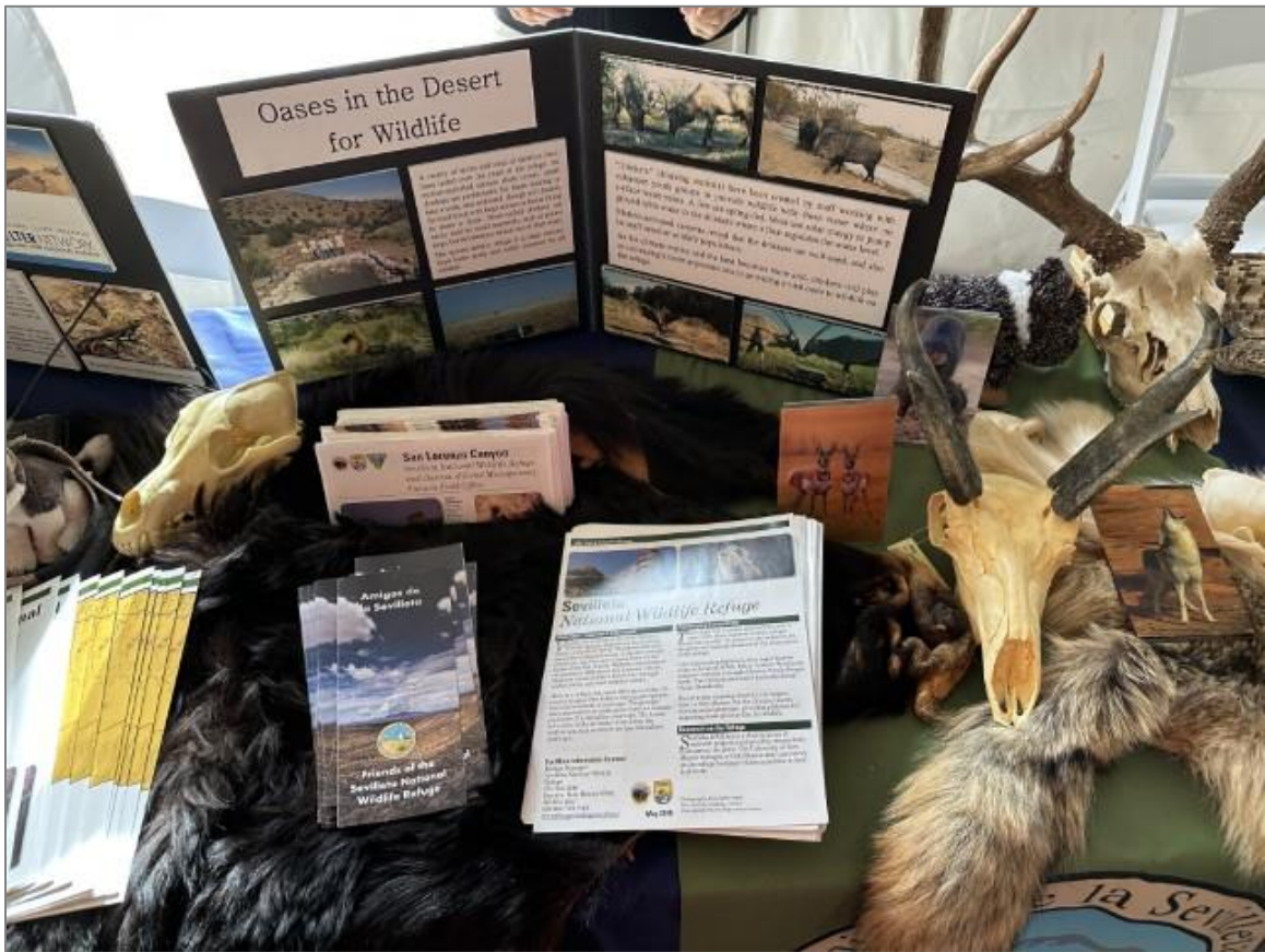
Our booth table at the Festival of the Cranes included hand-outs as well lots of materials show the rich native fauna of Sevilleta and the breath of activities that occur there.

In November, the Amigos and volunteers staffed a table at the Bosque del Apache Festival of the Cranes. This event is, without a doubt, the best attended refuge event in the state, attracting visitors from all over the country due to the magnificent opportunities to observe and photograph the Sandhill Cranes and snow geese. Our table was in a tent along with tables from Valle do Oro, and the National Fish & Wildlife Service, to name just two of the many groups participating.