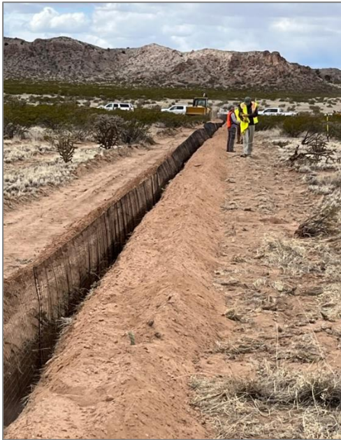
Trench with fence in

All in all, we will be bringing in new refuge inhabitants to help us move toward a naturally functioning system, both in the office and in the field.