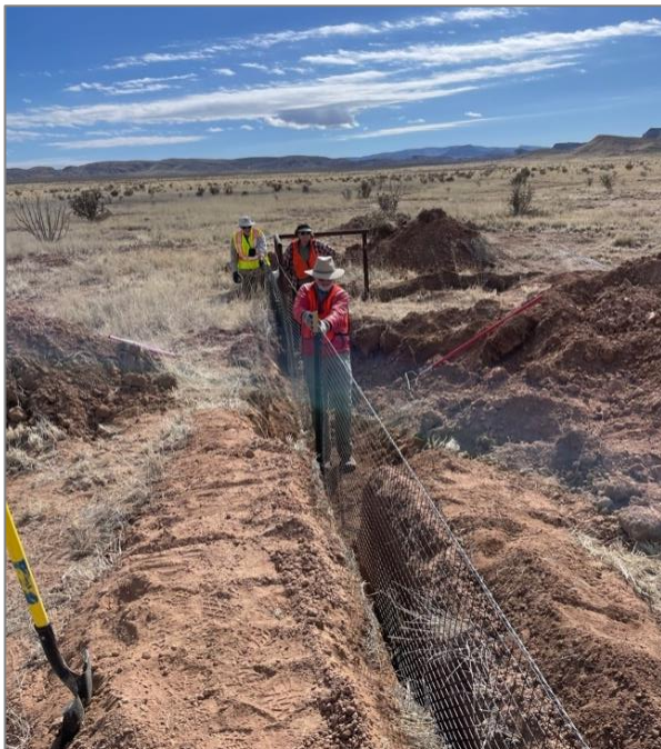
Trench with fence in